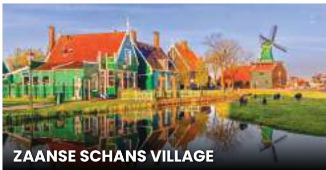
ZAANSE SCHANS VILLAGE