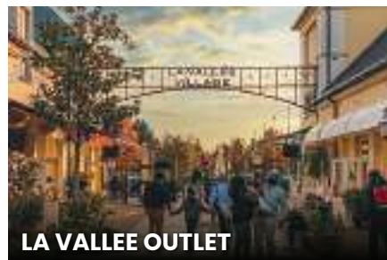
LA VALLEE OUTLET